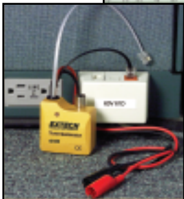
Alligator clips plus modular connectors for all testing needs