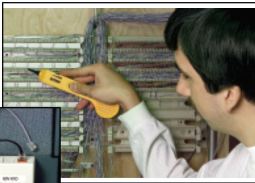
Trace phone/data wiring